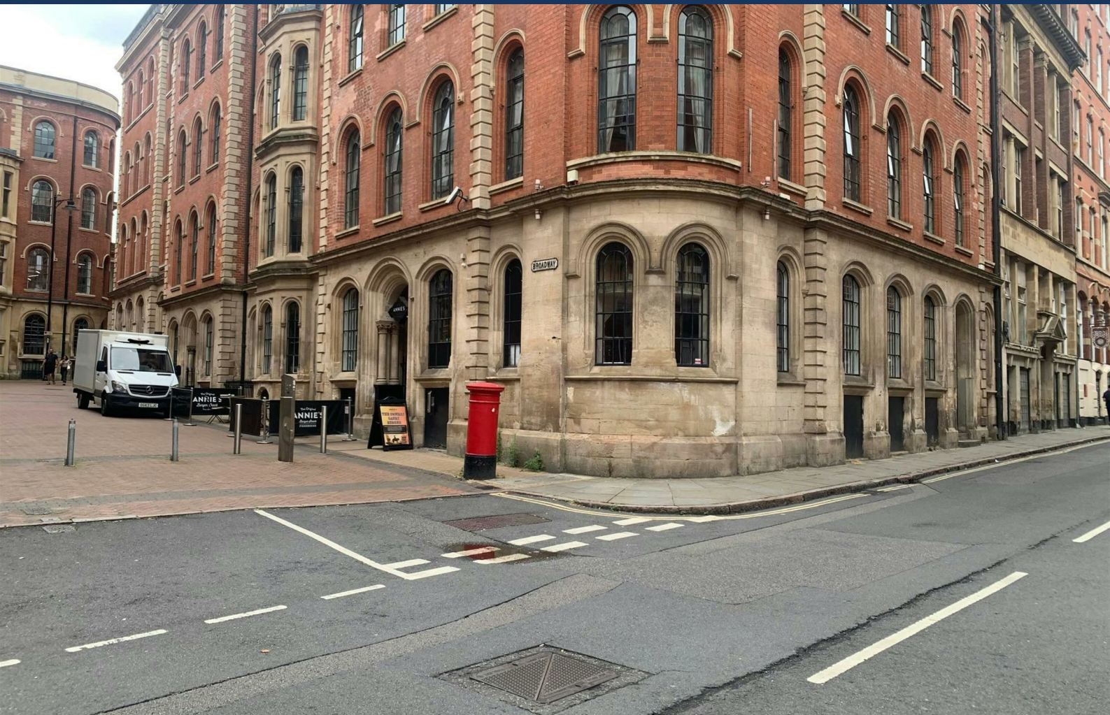
Lace Market, Nottingham NG1 1PR

Iconic Restaurant site available TO LET in Nottingham Lace Market